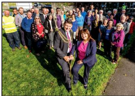
St Austell Town Council take over St Austell Library in October 2017

As part of the Town Council's visionary devolution project, the Town Council in the summer of 2013 took on the maintenance of the designated footpaths in St Austell for the first time. Responsibility for weed treatment on public highways and pavements also passed to the Town Council in the spring of 2014.