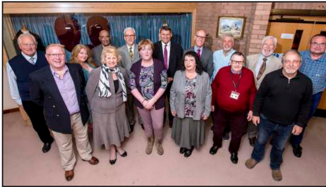
St Austell Town Councillors elected in May 2017 inside the council chambers situated in Cornwall Council's One Stop Shop

Services and facilities provided within the town of St Austell are also enjoyed by people living in the surrounding villages and by the many tourists who