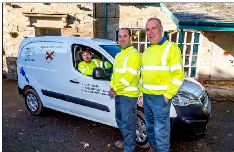
GREEN CREDENTIALS: St Austell Town Council takes delivery of an all-electric van