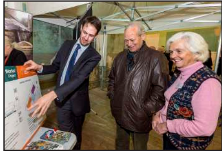
Plans to regenerate St Austell's ancient Market House are made public in 2017

The Town Council has supported the BID in its first five years of operation and is pleased that it has just received approval for another five year term.