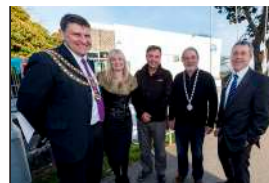
The House re-opens after a facelift in March

It's hoped that Young People Cornwall will re-locate their headquarters to the building and create a centre of excellence for youth services in St Austell.