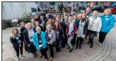
Multi-agency visit to St Austell Town Centre in 2017 involving Police and Town Councillors too

During 2016 Cornwall Council was persuaded to allocate resource to St Austell from its Safer Cornwall team and is now supporting this work.