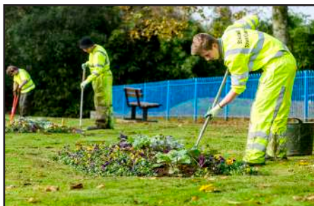
St Austell Town Council Grounds team maintaining play areas and parks throughout the town

The benefits of the local management of services are already being demonstrated through better maintenance of parks, public conveniences and play areas and more frequent grass cutting.