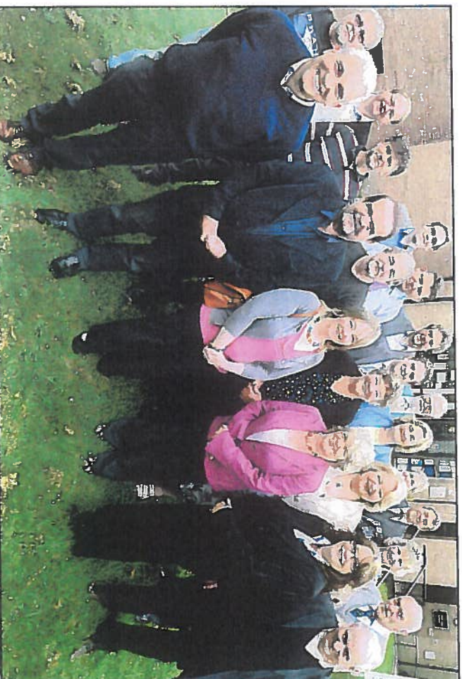
TOWN COUNCIL: Councillors elected in May 2013