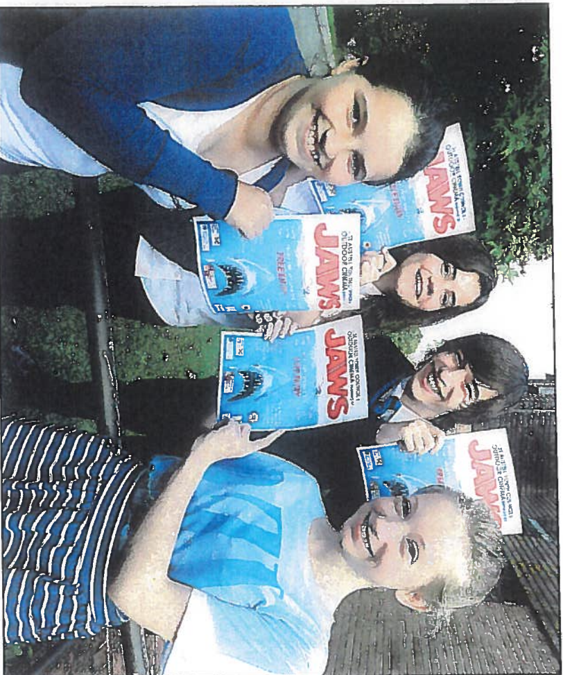
YOUTH COUNCIL: Members promote the successful outdoor cinema event

On the 28th April 2014 a Youth Council for St Austell was formally constituted and is currently working very well on a number of events and issues for young