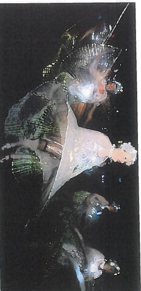
TORCHLIGHT CARNIVAL: Supported by St Austell Town Council

people in the town. An outdoor cinema event held at the Football Club in September was a resounding success.