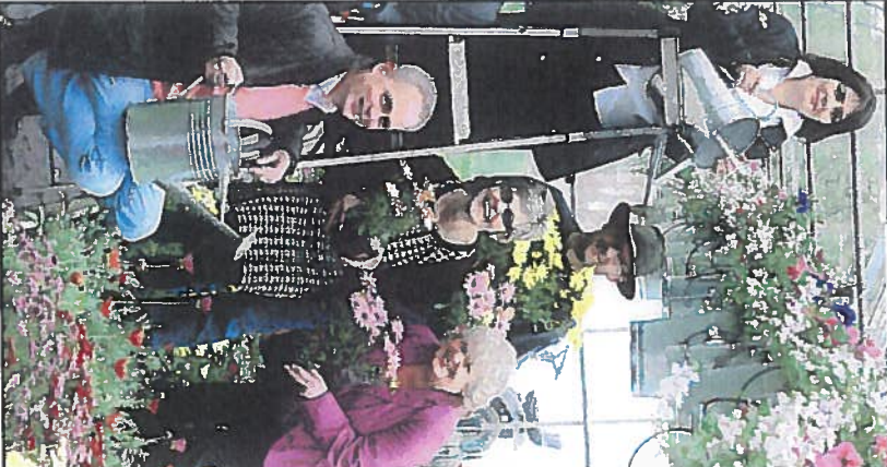
PLANNING: BID members and the council have worked together to brighten the town centre

The St Austell and surrounding parishes Town Framework will be a document which will set out a vision and options for the future development and change of the urban area of St Austell and its immediate hinterland. Work has taken place throughout the year with Cornwall Council's planning officers to produce a draft Town Framework consultation document. A number of consultation