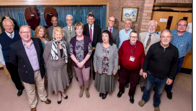
St Austell Town Councillors elected in May 2017 inside the council chambers situated in Cornwall Council's One Stop Shop

The Town Council seeks to work in partnership with Cornwall Council and other agencies in order to ensure delivery of the highest quality services and facilities to local residents.