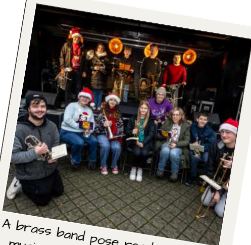
A brass band pose ready to play music at the Christmas Lights Switch On Event