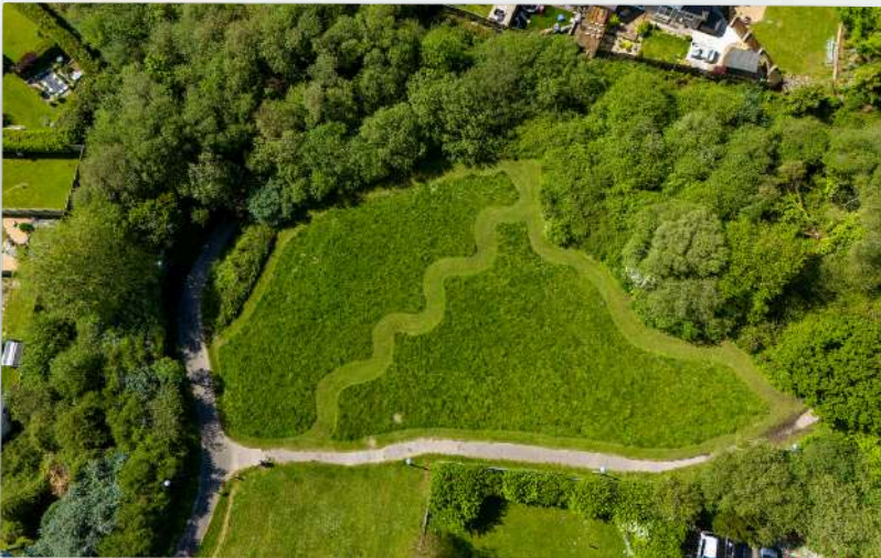
Paths mown into a 'wild area' at Polmarth Close open space.