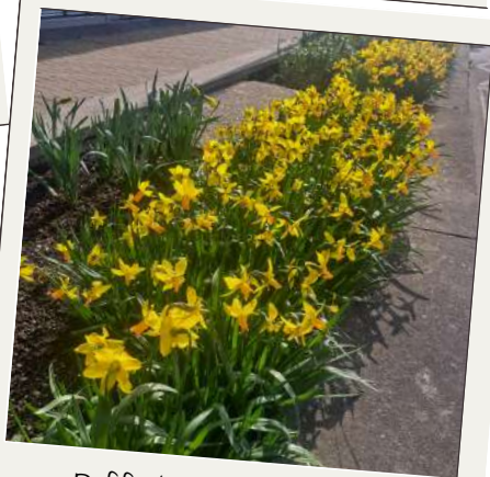
Daffodils on Trinity Street