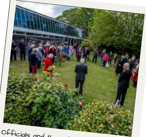
Officials and the public gather for the commemorative VE Day service outside St Austell Library