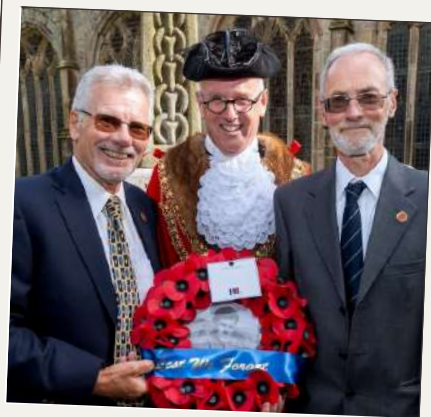
Commemorative service for the 80 th anniversary of D-Day