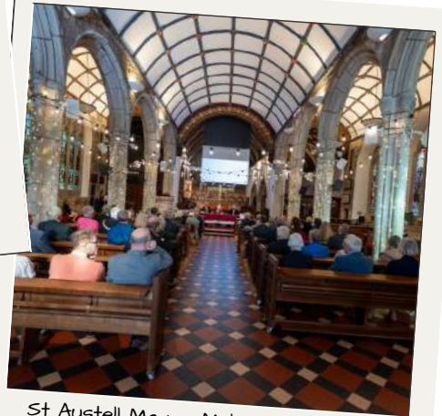
St Austell Mayor Making Ceremony, June 2024.