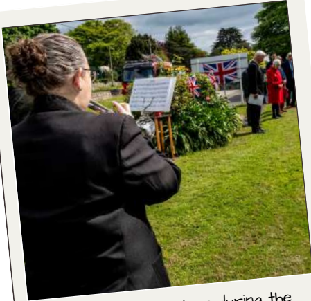
A lone trumpet plays during the commemorative service