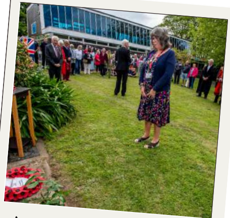
A member of library staff lays a wreath for 80 years since VE Day