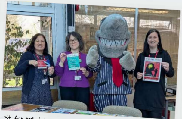
St Austell Library Staff pose with the "Loan Shark" at an awareness event