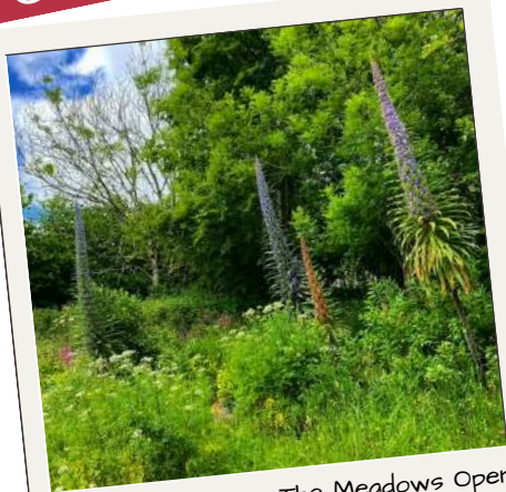
A wild area near The Meadows Open Space, as part of the Making Space 4 Nature campaign