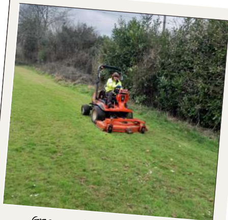
Grass cutting season begins!