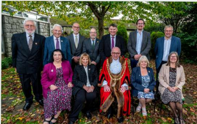
Former Mayors meet at St Austell Library to mark 15 years since the creation of St Austell Town Council

The Town Council has provided annual funding of £20,000 since 2017 to secure the future of The House youth project and enhance youth services in St Austell. Youth workers undertake outreach work on behalf of the Council when issues with young people arise. Young People Cornwall (YPC) provide a range of important health and well-being services, training, support, activities and guidance for young people as well as a regular youth clubs from The House.