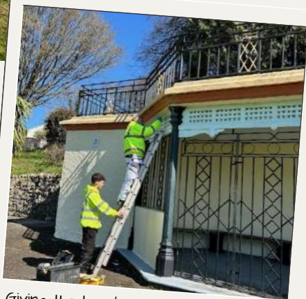
Giving the band stand in Truro Road Park a fresh lick of paint