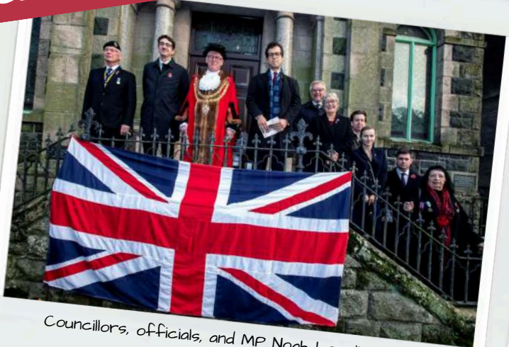
Councillors, officials, and MP Noah Law line up on Remembrance Sunday