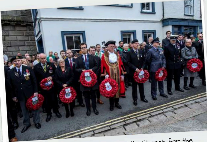
Officials line up outside Holy Trinity Church for the Remembrance Sunday Service.