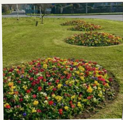
Flower beds on Mount Charles roundabout