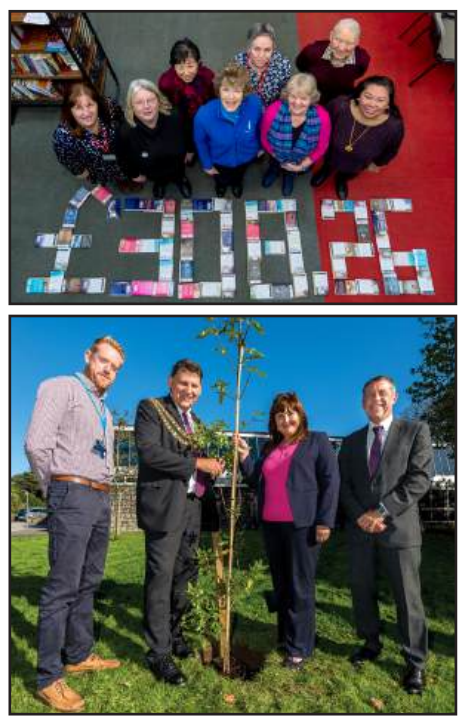
St Austell Soroptimists gift the library with £308 to buy new equipment (Centre) and St Austell Town Council take over the library in 2017 (Above)

The Council aims to make the Library a community hub which provides benefits way beyond the traditional functions of a library.