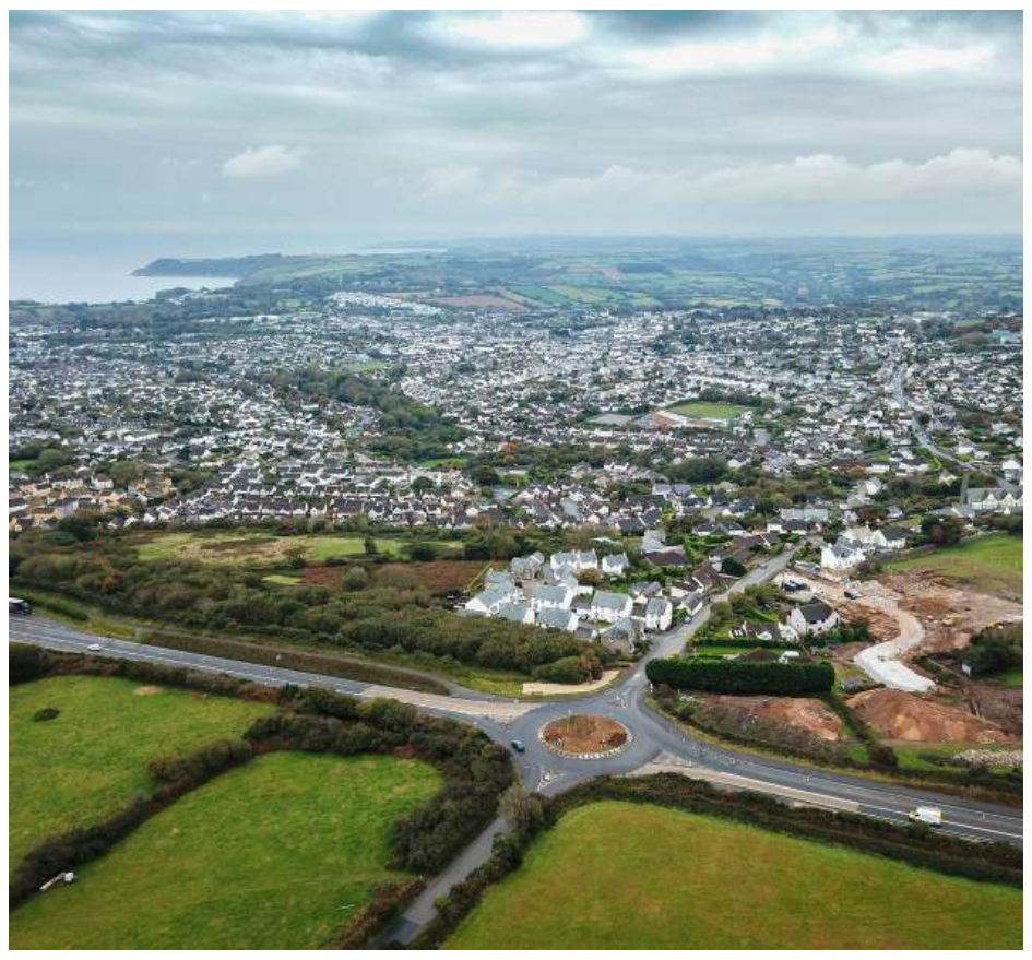
ST AUSTELL: This spectacular aerial picture looking west shows how much St Austell continues to develop and grow year on year