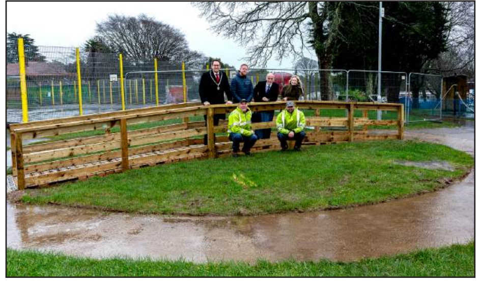
The installation of a new pedestrian bridge in Poltair Park (Above) to improve accessibility in a poorly draining area and to allow the widest possible cross section of users safe and easy access