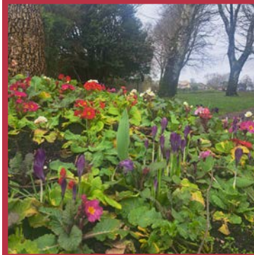
Spring flower display in Poltair Park

St Austell Town Council has awarded £8,750 to 22 local organisations and charities through its Small Grants Scheme during 2025–2026, supporting a range of community-focused projects. Following the scheme’s success, the Council has increased the budget to £10,000 for 2026–2027, creating more opportunities for local groups to access funding. Organisations interested in applying can visit the Town Council’s website or email info@staustell-tc.gov.uk for more information.