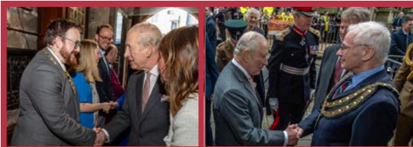
Incoming Mayor Cllr Ethan Stephens and outgoing Mayor Cllr Colin Hamilton shake hands with His Royal Majesty King Charles III during the Royal visit to St Austell in March

The visit also included an opportunity to meet St Austell Library staff, Cornwall Hospice Care and Young People Cornwall, alongside the Mayor and Deputy Mayor. Conversations focused on the services and initiatives supporting local people and the ongoing work to sustain a vibrant town centre and a strong community.