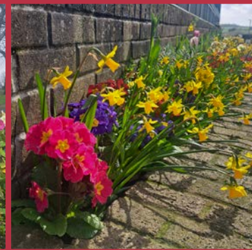
Spring flower display on Trinity Street