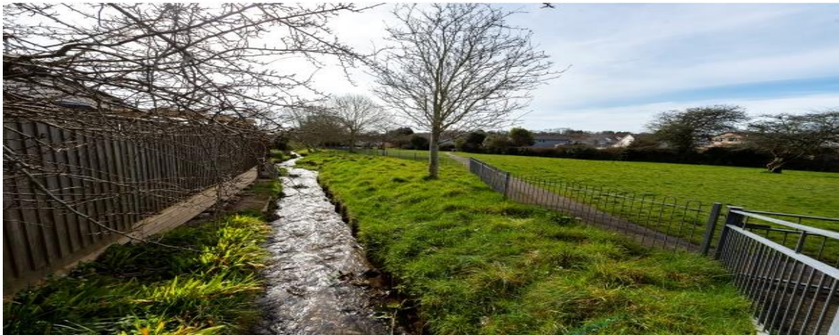
Penmere Road Park