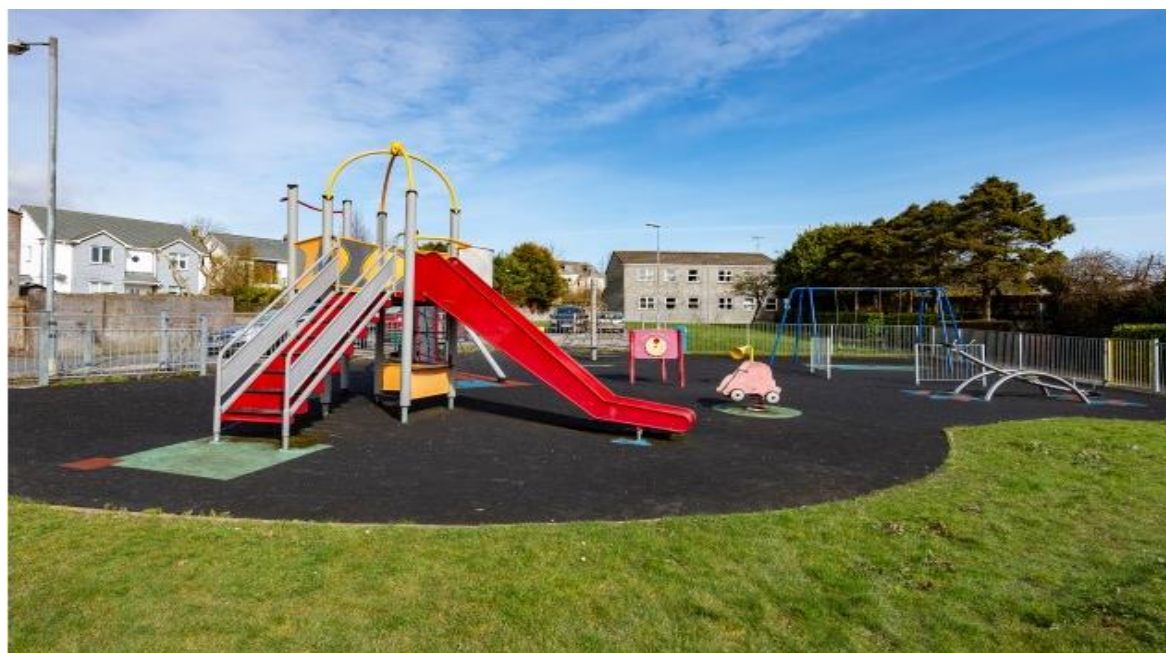
Thornpark Road Park