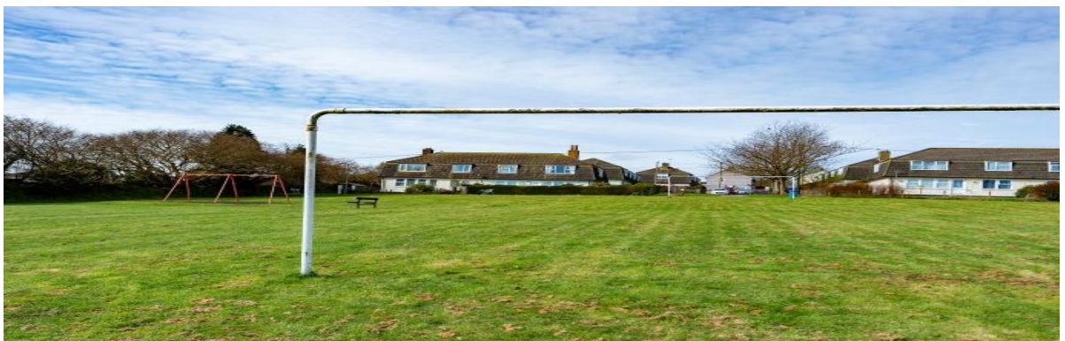
Woodland Close Park