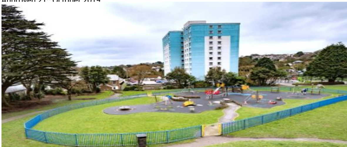
Truro Road Park