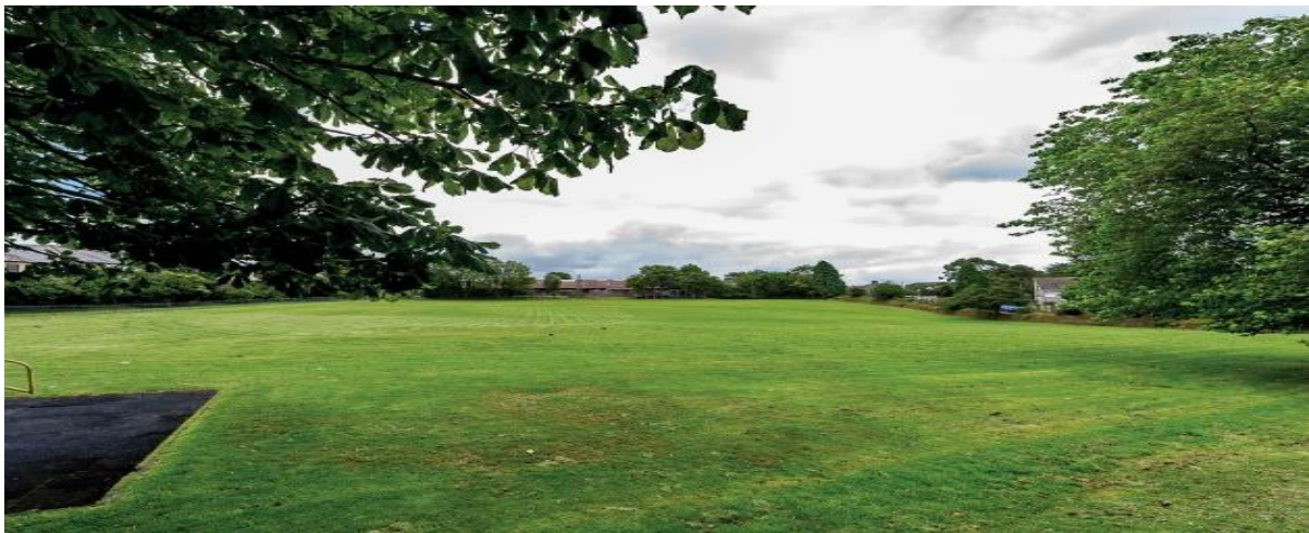
Woodland Road Park