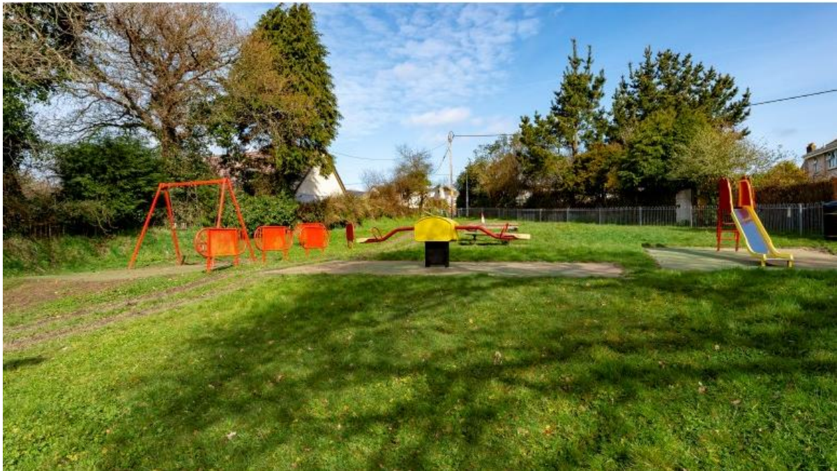
Chapel Field Park